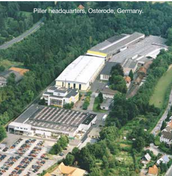
Piller headquarters, Osterode, Germany.