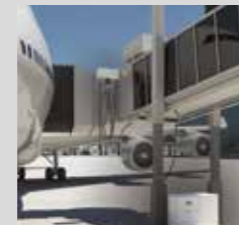
APOJET AJR APOHOIST or APOCOIL