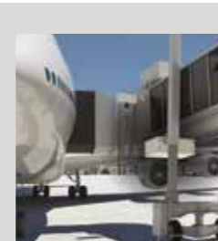
APOJET AJS APOHOIST

The diagram illustrates typical applications using Piller equipment to protect critical airport systems and provide quality power to aircraft at the boarding gates and maintenance hangers.