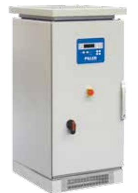
APOJET AJS static GPU.