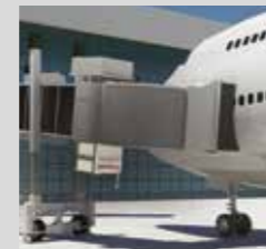
APOJET AJT APOCOIL