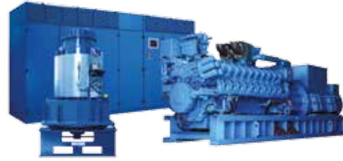
UNIBLOCK™ Rotary UPS and Diesel Rotary UPS systems.