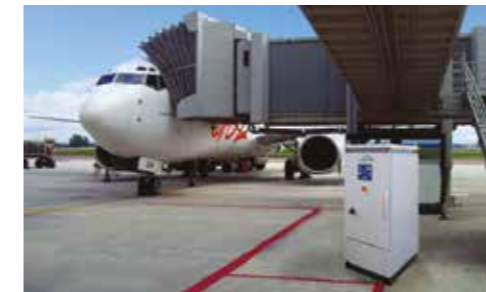
Piller ground support with Solid State Converter.