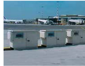
Rotary outdoor GPU APOJET AJR apron mounted.