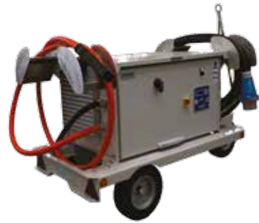
APOJET AJS Combi.