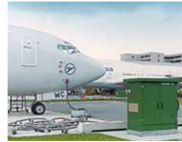
Piller Gate Box.