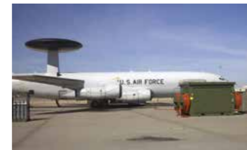
Piller equipment at AWACS bases worldwide.

In the field of 400Hz frequency converters, Piller's ground power equipment such as APOJET AJS, APOJET AJR and APOJET AJT can be found in operation at major airports and military air bases throughout the world. Piller provides tailor-made solutions for each project. Through continuous research and development a high level of flexibility is guaranteed in meeting clients' requirements. All Piller ground power equipment is designed and built to the highest quality.