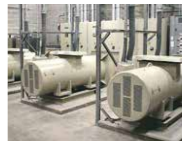
Central system with Piller Motor-Generator Sets.

Piller provides its customers with a complete line of rotary and static (solid state) frequency converters and UPS systems as well as gate boxes, distribution panels and accessory equipment such as cable hoists and retrievers.