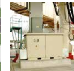
Piller Solid State converter APOJET AJS.

Every organisation hopes they never have to call upon their UPS systems but with Piller there comes the ultimate peace of mind.