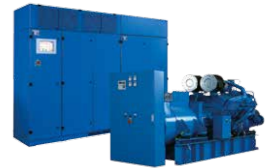
UNIBLOCK™ Diesel Rotary UPS System.

Every organisation hopes they never have to call upon their UPS systems but with Piller there comes the ultimate peace of mind.